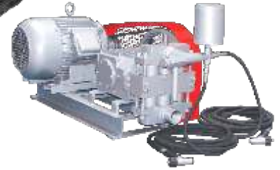
P 36/40 & 76/40 ▲