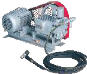
▲ P 36/30