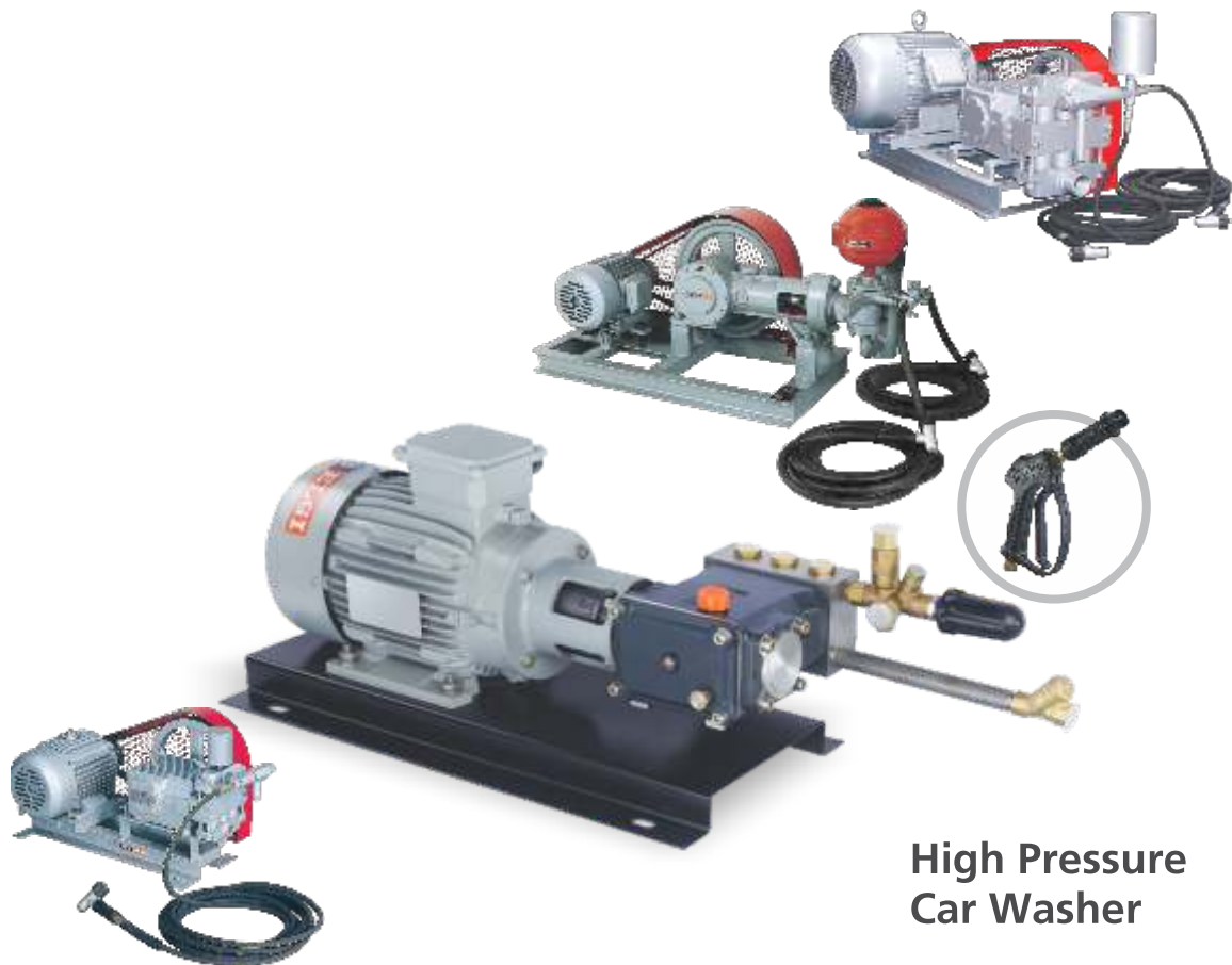
High Pressure Car Washer