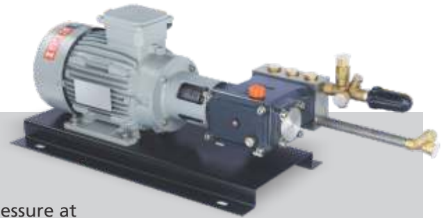
HL 03 045 ▲