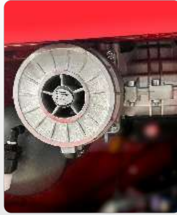
Low Power Consumption & High Torque