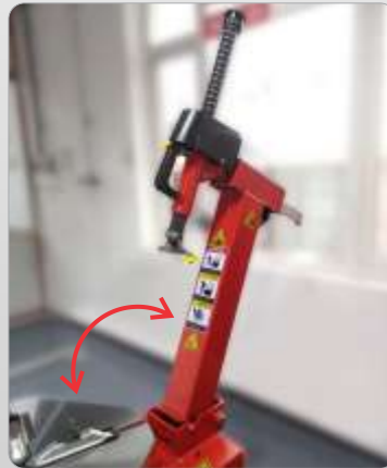
Pneumatic Powered Tilted Column - can be Tilted Back & Forth