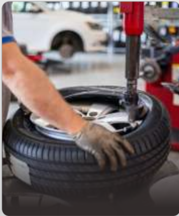
Variable Speed Operation - No Tyre Breakage