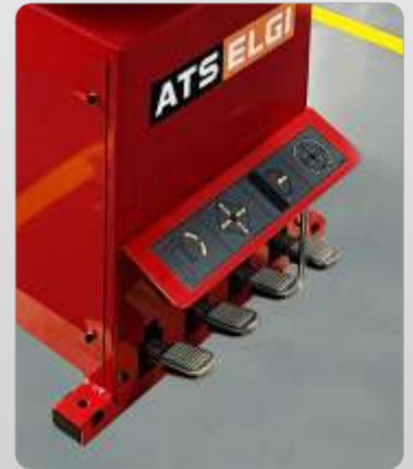
The Pedal Assembly Features an Ergonomic Italian Design & a Robust Structure