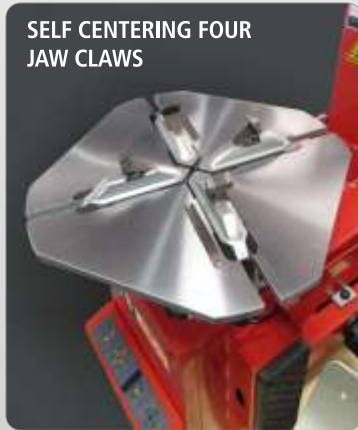
SELF CENTERING FOUR JAW CLAWS