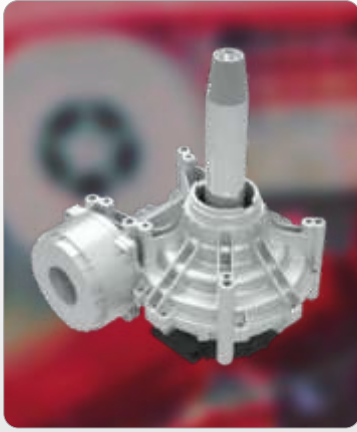
Motor Directly Coupled with Inverter Gear Box