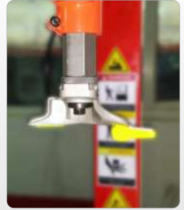
Special Material Mounting & De-mounting Head - Handles Run-Flat & Low-Profile Tyres